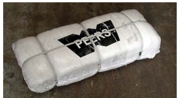
20 Kg Bale

www.peers.co.nz For Industrial Consumables