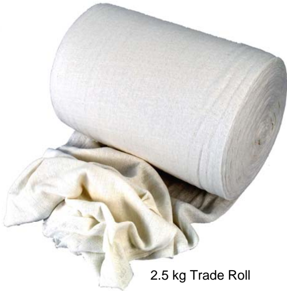
2.5 kg Trade Roll